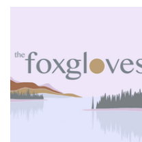
The Foxgloves debut EP June 2021