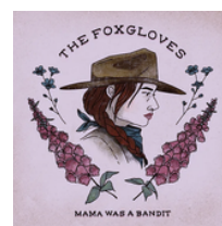
"Mama was a Bandit" The Foxgloves full-length album Sept 2022