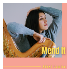
"Mend It" solo debut single Oct 2023