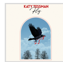
"Fly" Katy Tessman full-length album Oct 2023